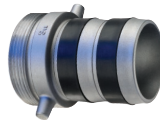
Aluminum Pin Lug Hose Shank Male End (NPSM Threads)