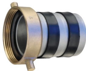
Aluminum Pin Lug Hose Shank with Brass Swivel Nut Female End (NPSM Threads)