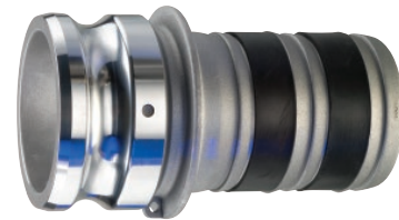
Aluminum Part E Male Adapter x Hose Shank