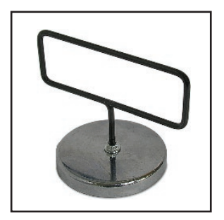
Die Removal Magnet (Included) P/N:104679