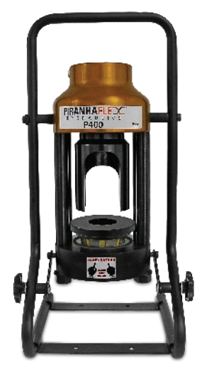
Light Weight Portable Unit: Truly "portable" crimper can be carried to almost any location where services is required.