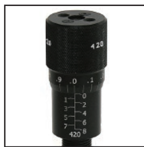
T420 Micrometer (Available) P/N:103085