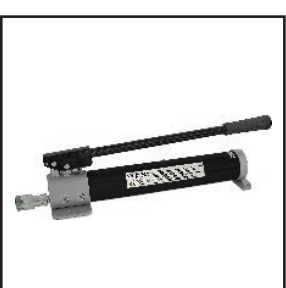
Hand Pump (Available) P/N:VHP-10-43