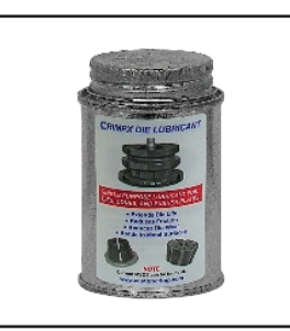
CRIMPX Die Lubricant (Available) Grease 4 oz can with brush P/N:104162