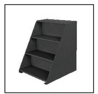
Die Storage Shelf (Available) P/N:101431