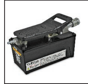
Pneumatic Pump (Available) P/N:VAP-10-100

Because we continually examine ways to improve our products, we reserve the right to alter specifications or discontinue products without prior notice.