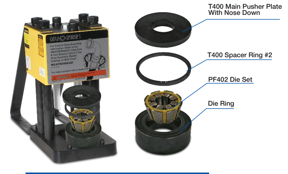
ENGINEERED TO ACCOMMODATE YOUR NEEDS