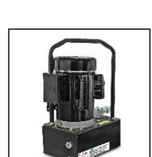
Electric Pump (Available) P/N:VEP1001