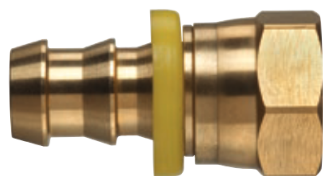
POFFJS Dual Angle