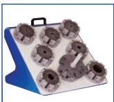
Die Rack (8 pc.) DIERACK-H119