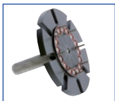
Production Quick Change Die Tool KCPQCT-H130