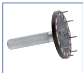
Quick Change Die Tool KCQCT-H119