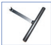
Die Segment Change Tool