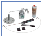
Cleaning and Lubrication Kit CALKIT-H130