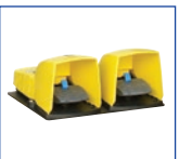
Electric Foot Pedals PEDAL-KC1