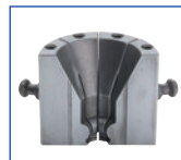
Custom Made Dies