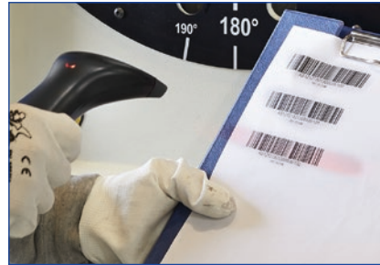
Barcode Reader instantly calls up saved crimp diameter