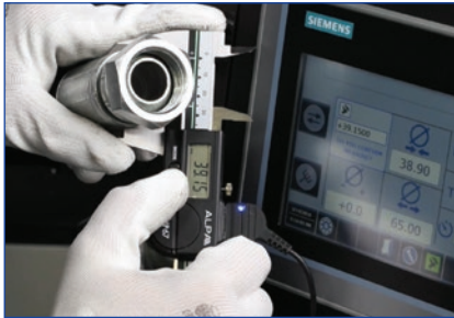
Digital Caliper automatically generates crimp correction for safety.

Webcam – Camera allows operator to view crimping process through 8" monitor. Includes additional LED lighting for better visibility.