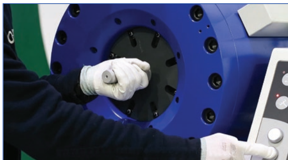
Master dies are guided through built-in channels on the tool on standard volume crimpers.

The innovative, Easy Set™ Production Quick Change Tool provides a quicker, easier and safer way to change out crimp dies. Traditional quick change tools must be manually centered and carefully held in place during the die changing process. Even a slight misalignment could cause the dies to be slightly out of place, potentially causing costly damage to the dies or the machine itself. However, the Easy Set™ Quick Change Tool's patented centering guides hold the tool in the correct position throughout the die changing process with minimal user effort, eliminating the risk of user error.