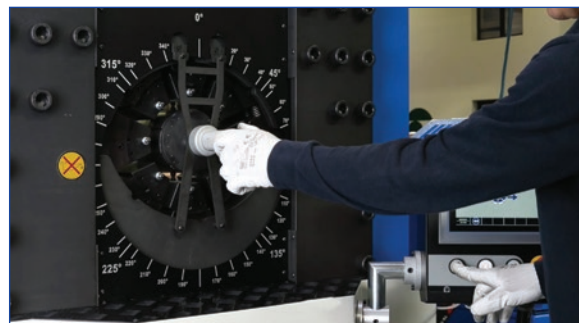
Tool held in place by built-in locking posts inserted into the crimper on high volume crimpers.