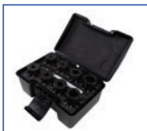
Case and Dies KC1-H47E-DIECASE