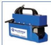
Battery Pump KC1-H47L-BPP