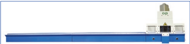
Measuring Hose Tray TRAY-TT30PI