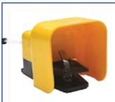
Electric Foot Pedal PEDAL-TT30PI

Because we continually examine ways to improve our products, we reserve the right to alter specifications or discontinue products without prior notice.