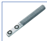
Die Segment Change Tool KCDCT-H39