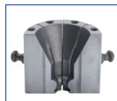
Custom Made Dies