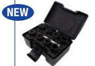
Case and Dies KC1-H47E-DIECASE