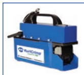
Battery Pump KC1-H47E-BPP