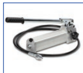
Hand Pump KC1-H47E-HP