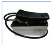
Air Pump KC1-H47E-PAP