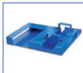
Support Frame KC1-H47E-BASE