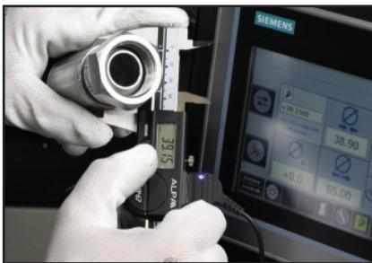
Digital Caliper automatically generates crimp correction for safety.

Webcam – Camera allows operator to view crimping process through 8" monitor. Includes additional LED lighting for better visibility.