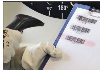
Barcode Reader instantly calls up saved crimp diameter