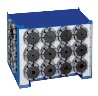
Die Base (18 PC.)