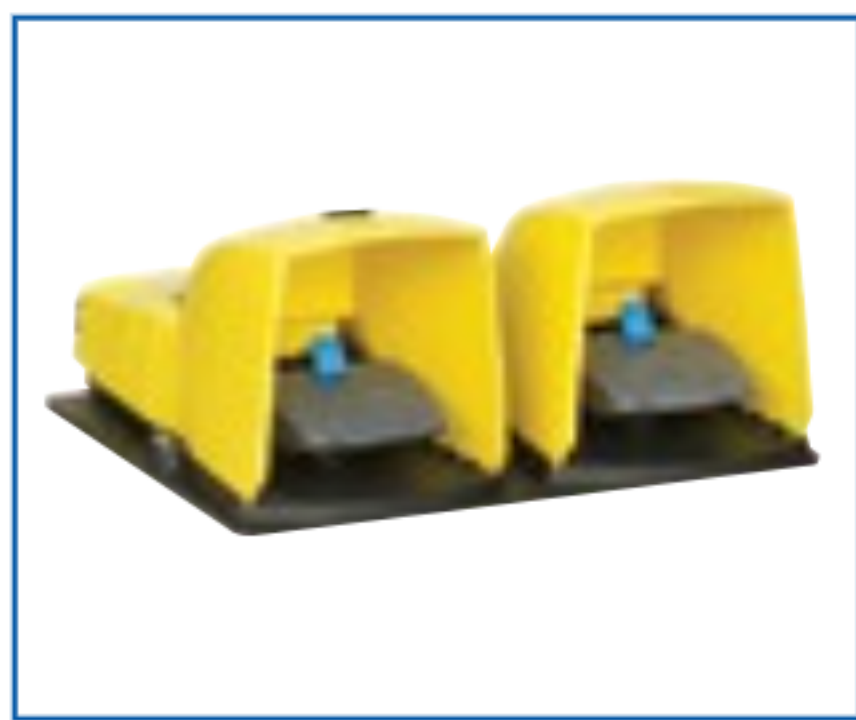
Electric Foot Pedals PEDAL-KC1