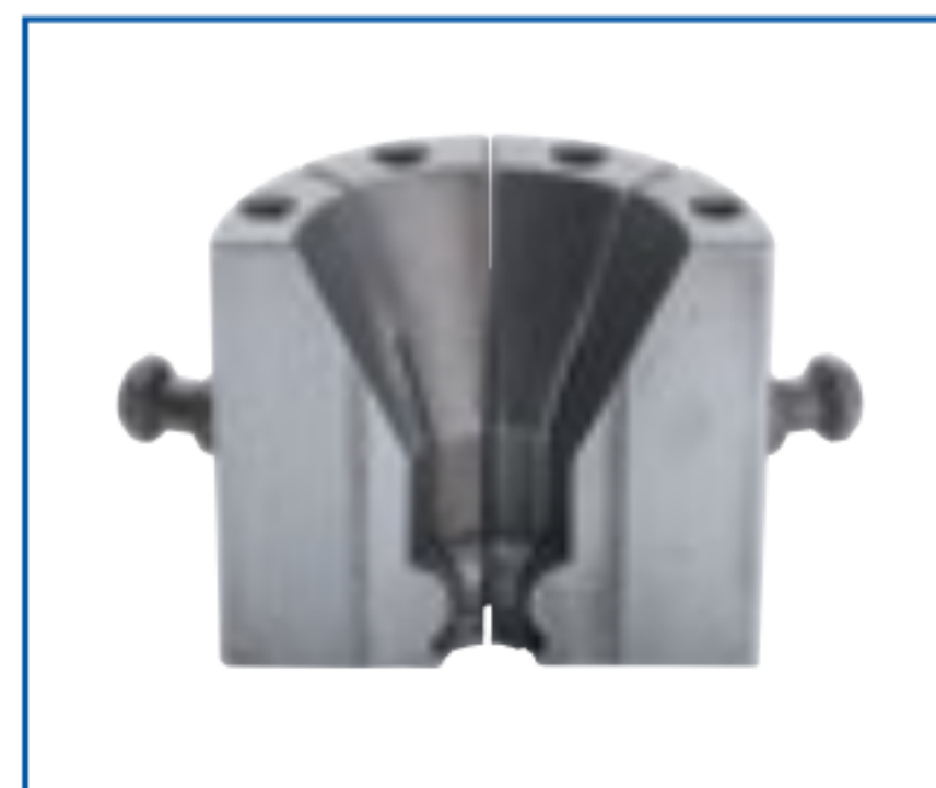
Custom Made Dies