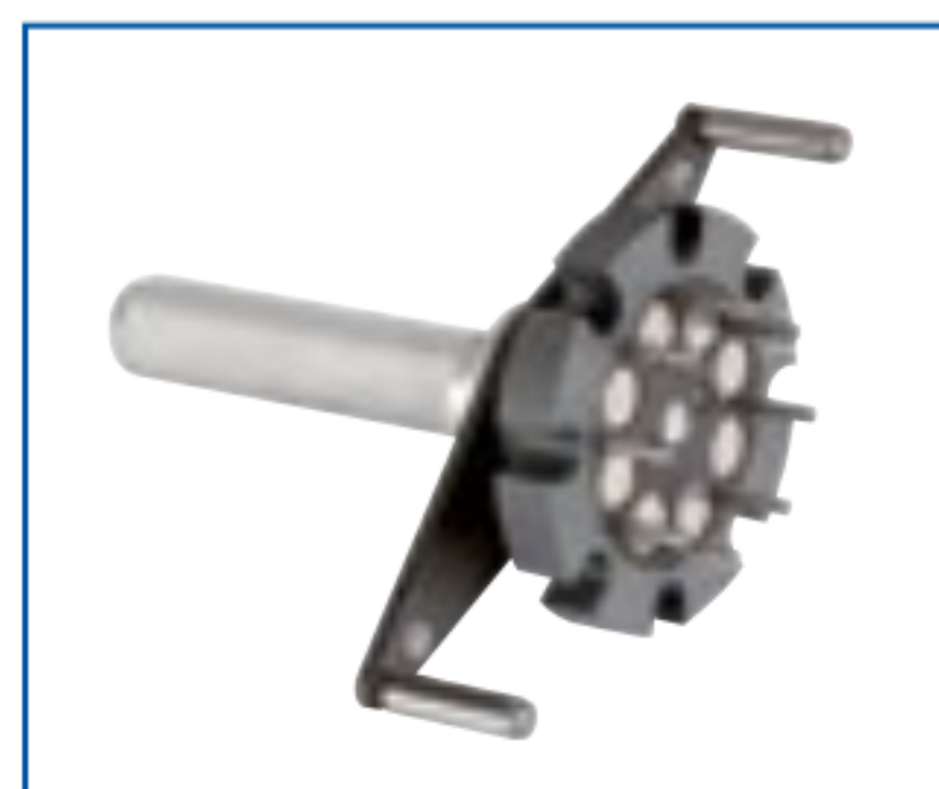
Patented Quick Change Die Tool KCPQCT-H69