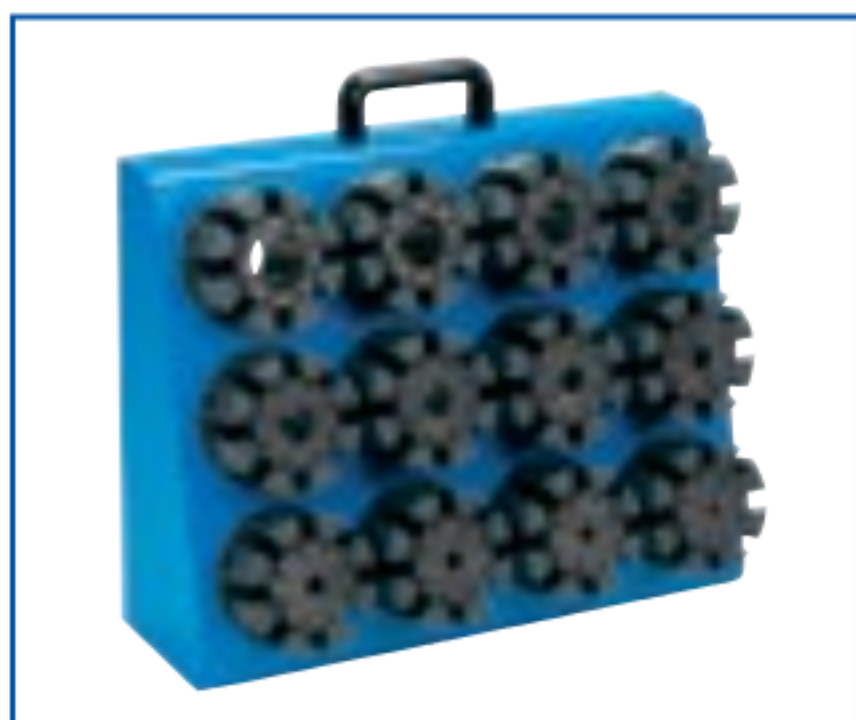
Die Rack (12 pc.) DIERACK-H69