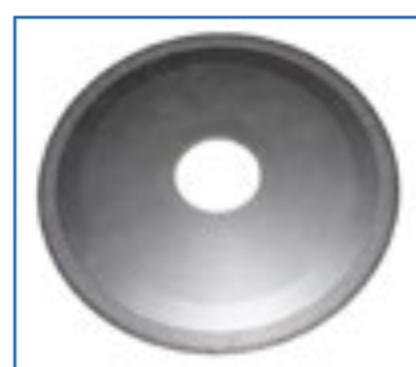
Diamond Blade BLADE-DIA250

Because we continually examine ways to improve our products, we reserve the right to alter specifications or discontinue products without prior notice.