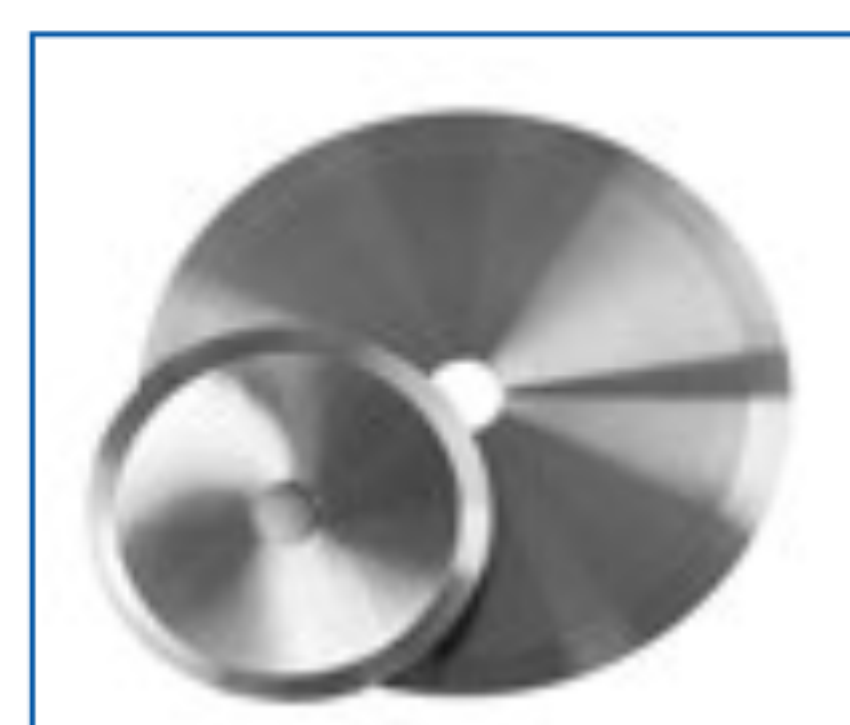
Smooth Blade BLADE-SMT250