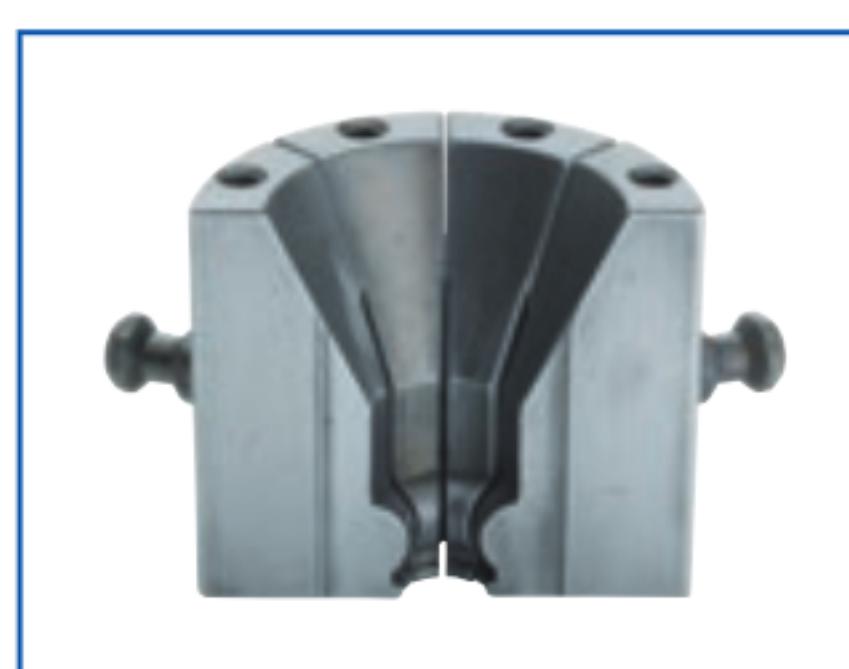
Custom Made Dies