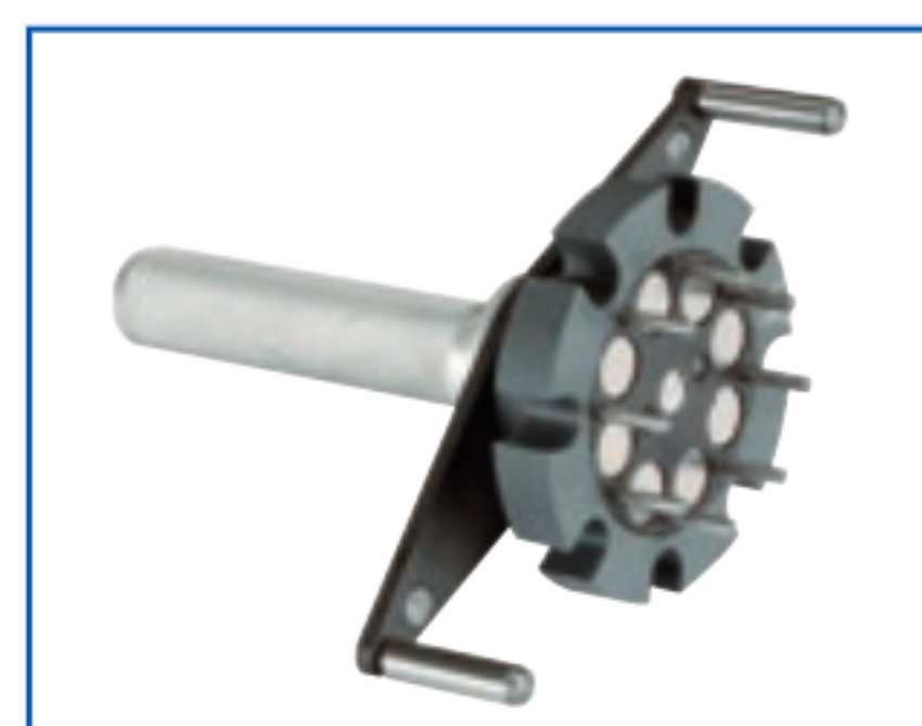
Patented Quick Change Die Tool KCPQCT-H69