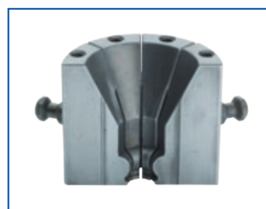
Custom Made Dies