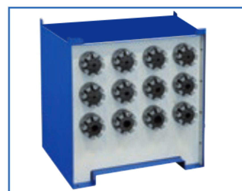
Die Holder Base (12 pc.) DIEBASE-H69