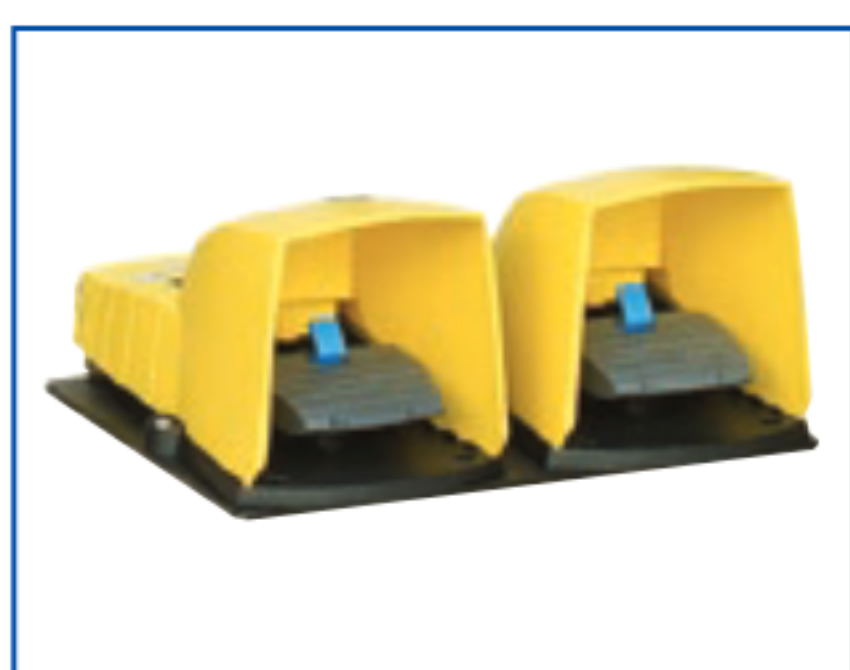
Electric Foot Pedals PEDAL-KC1