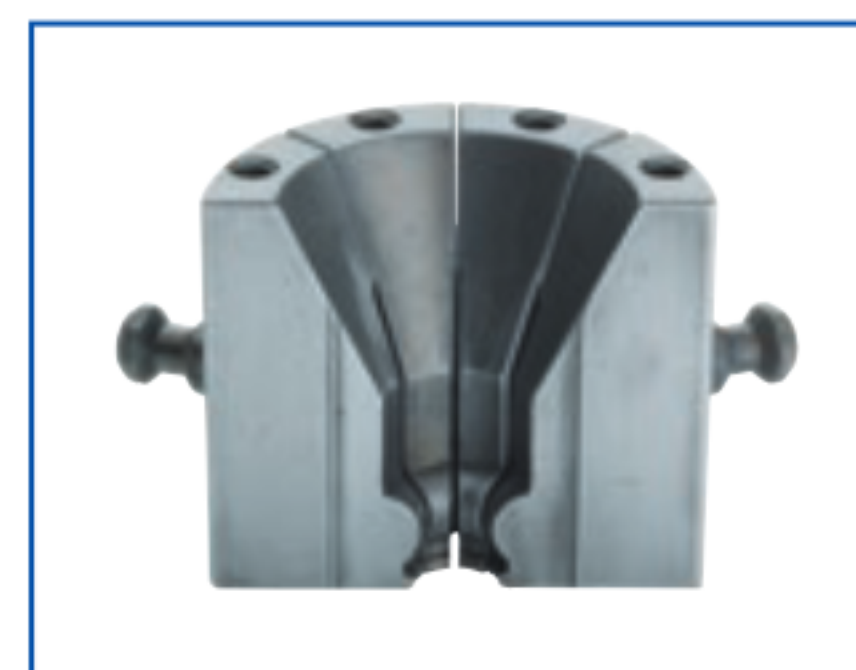
Custom Made Dies