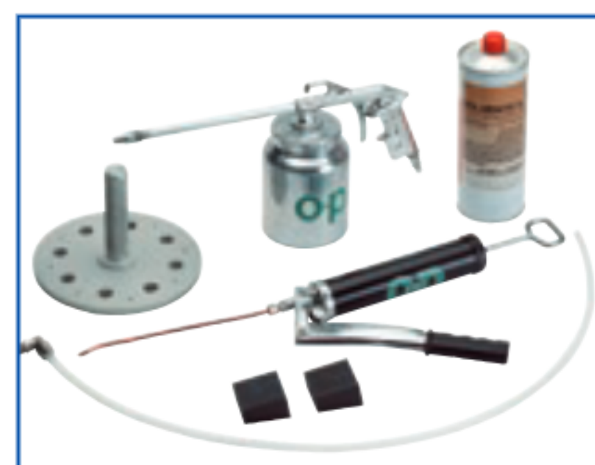
Cleaning and Lubrication Kit CALKIT-H130