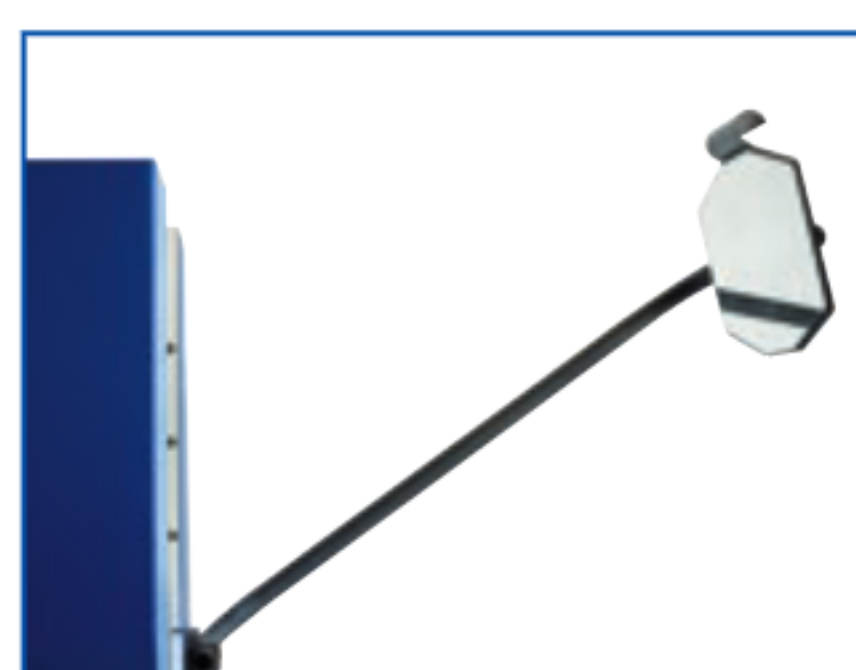
Back Mirror MIRROR-H135/170