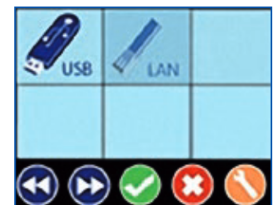
ES3 Upgrades (pg. 37)