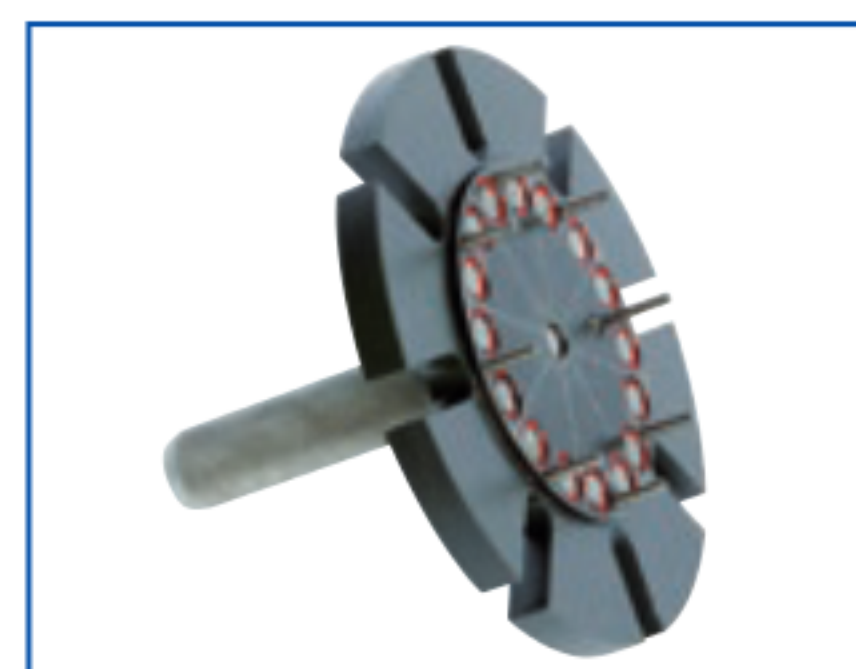
Patented Quick Change Die Tool KCPQCT-H135