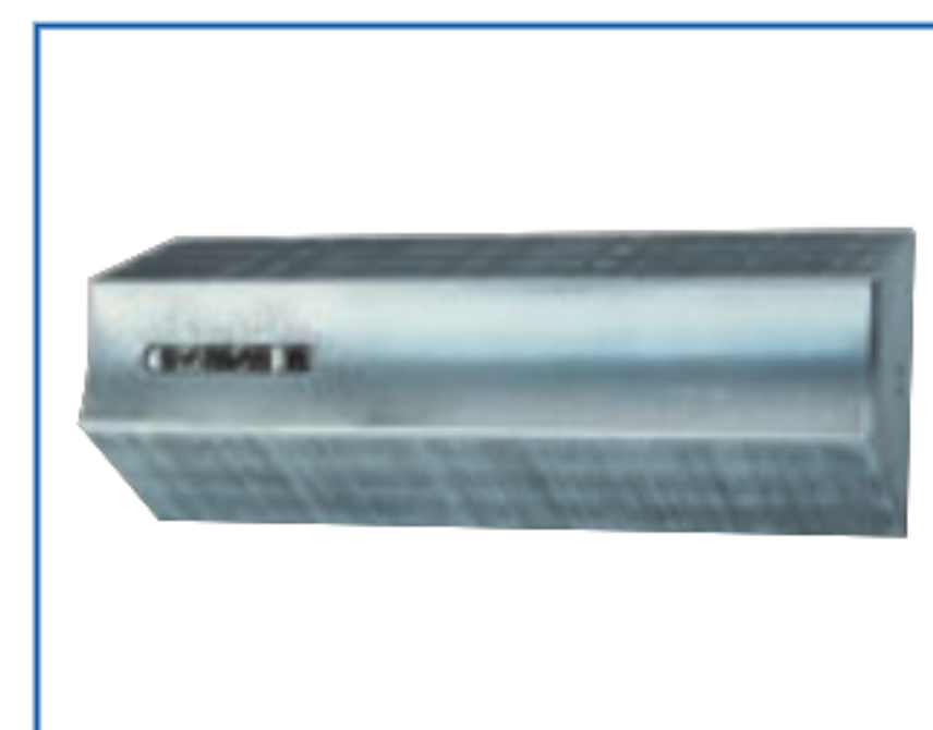
Marking Dies (pgs. 21 & 22)