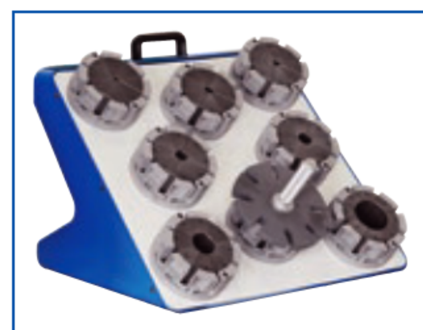
Die Rack (8 pc.) DIERACK-H119