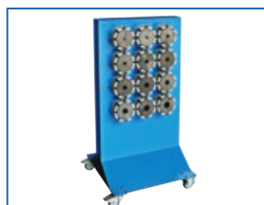
Die Cart (24 pc.) DIECART-V119