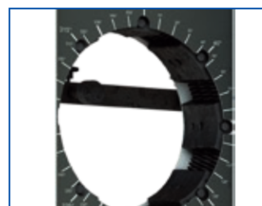
Fitting Orientation Protractor