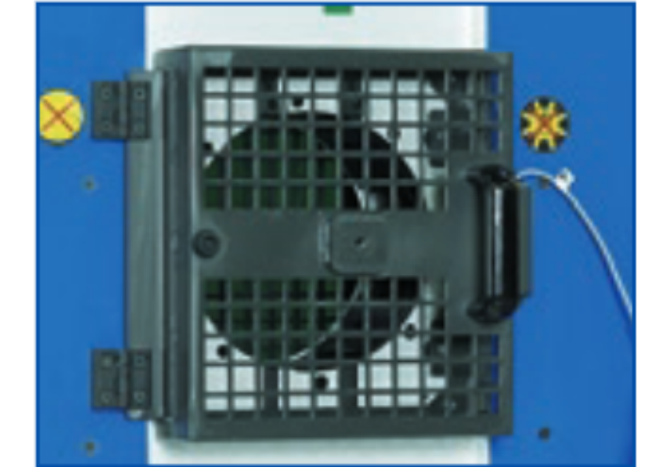
Protection Net with Activation Switch