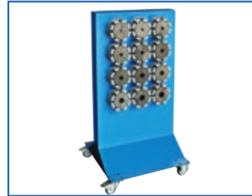
Die Cart (24 pc.) DIECART-V119