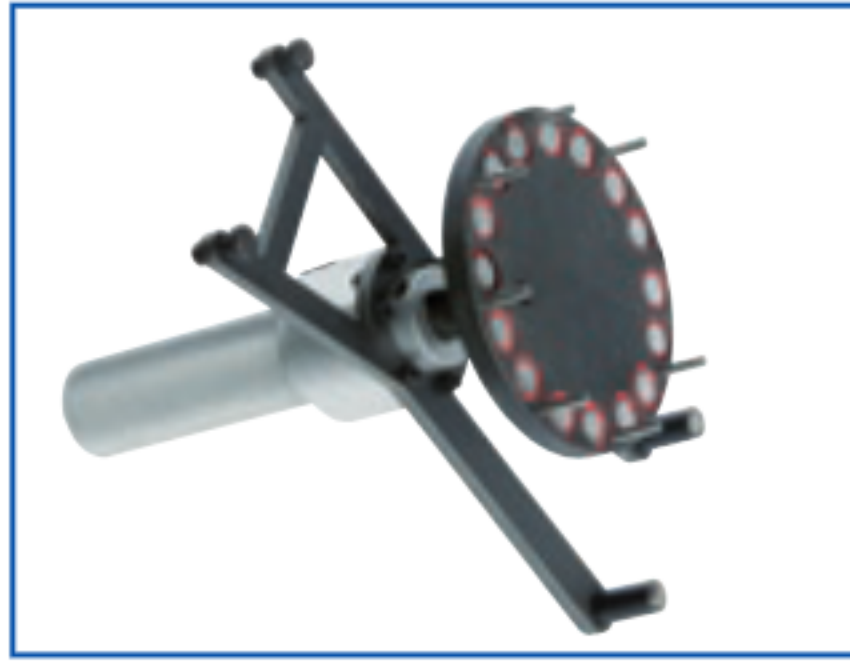
Patented Quick Change Die Tool KCPQCT-V159*