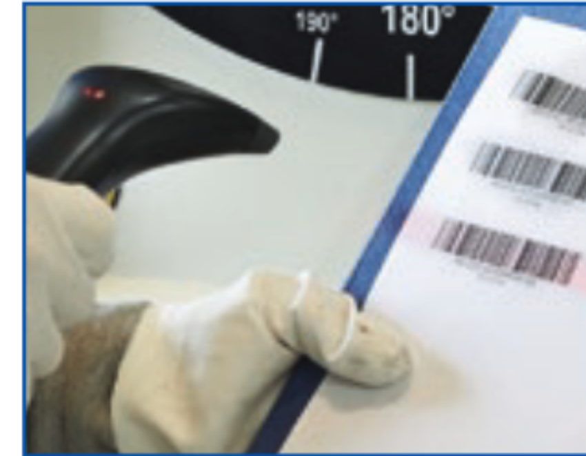
ES4 Upgrades (pgs. 38 & 39)