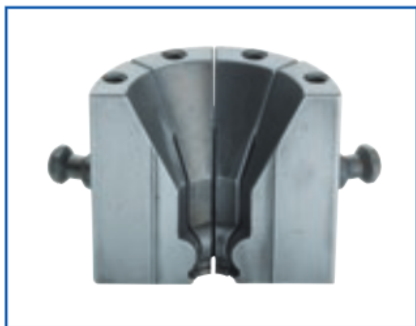
Custom Made Dies