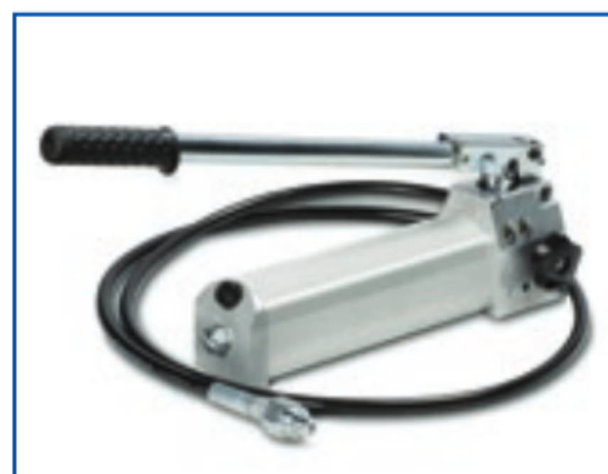
Hand Pump KC1-H47E-HP