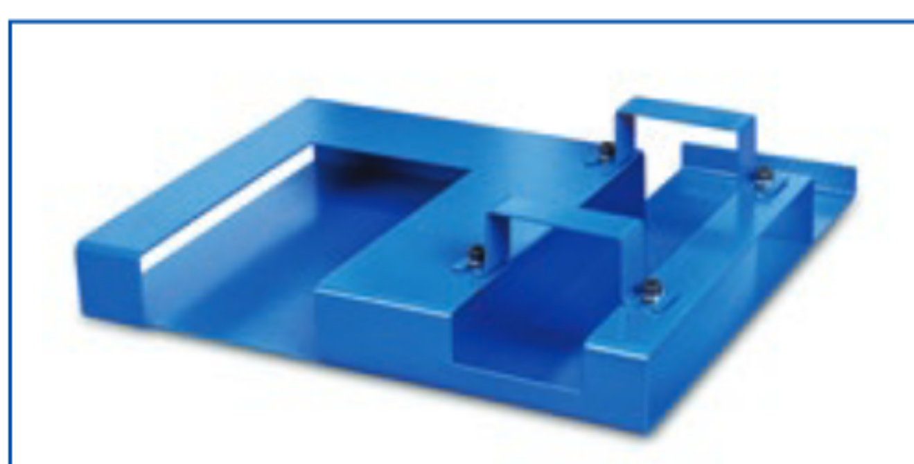
Support Frame KC1-H47E-BASE