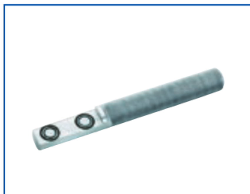
Die Change Tool KCDCT-H39