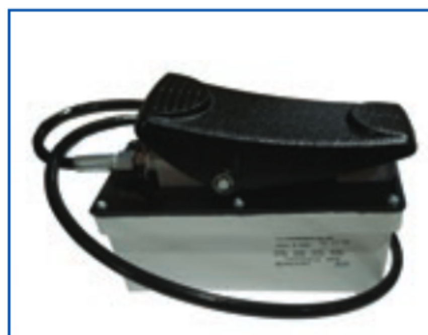
Air Pump KC1-H47E-PAP