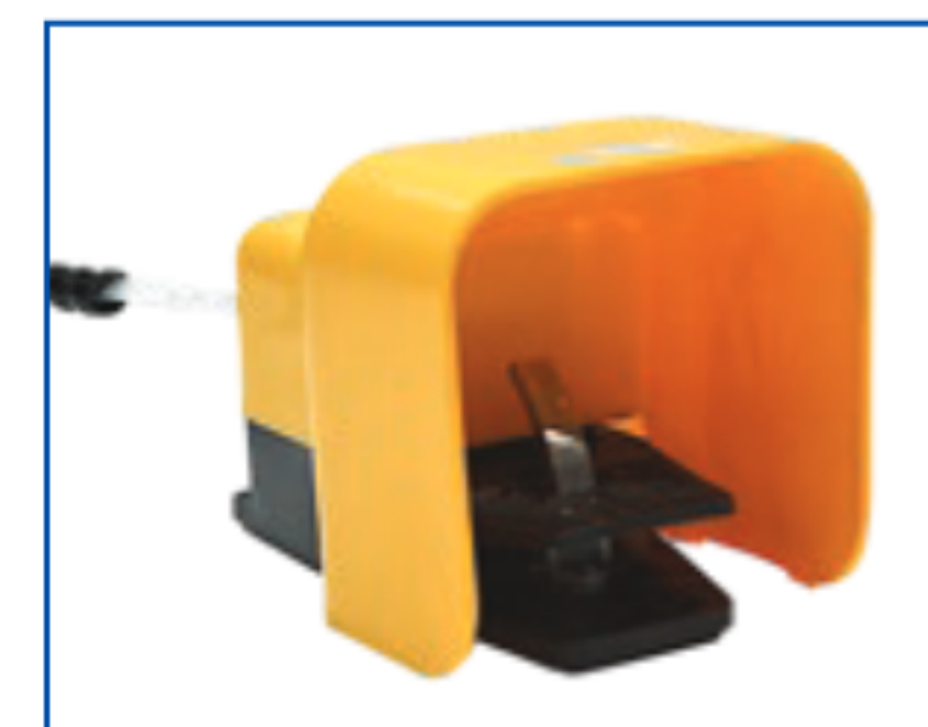
Electric Foot Pedal PEDAL-TT30PI

Because we continually examine ways to improve our products, we reserve the right to alter specifications or discontinue products without prior notice.