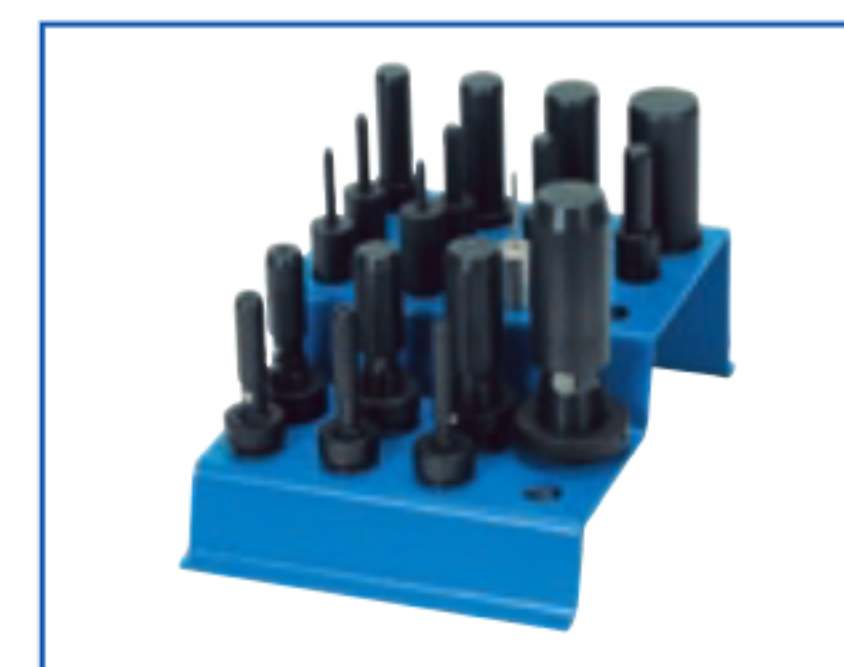
Mandrel Holder Stand MANDSTAND1