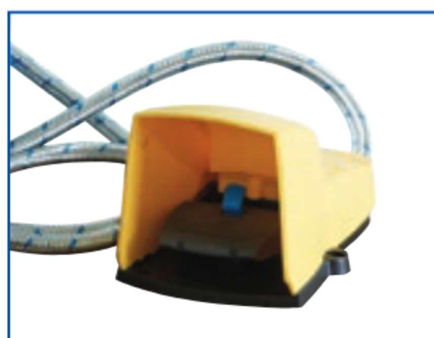
Electric Foot Pedal