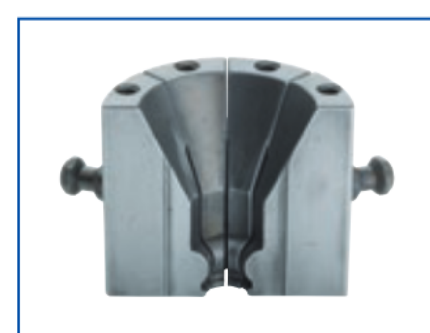
Custom Made Dies