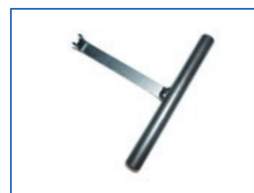
Die Change Tool