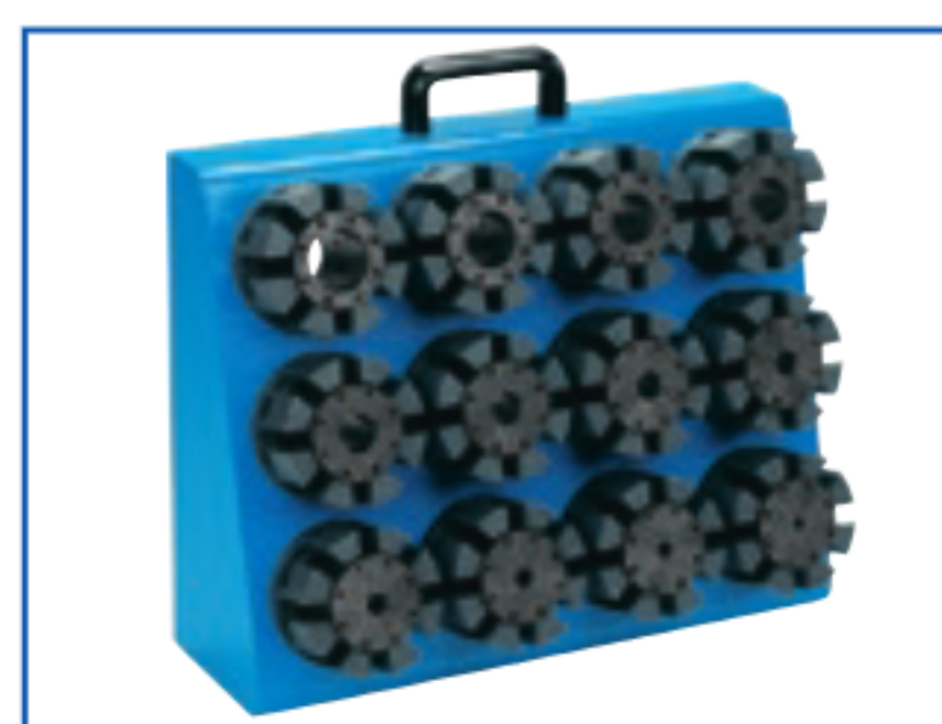
Die Rack (12 pc.) DIERACK-H69