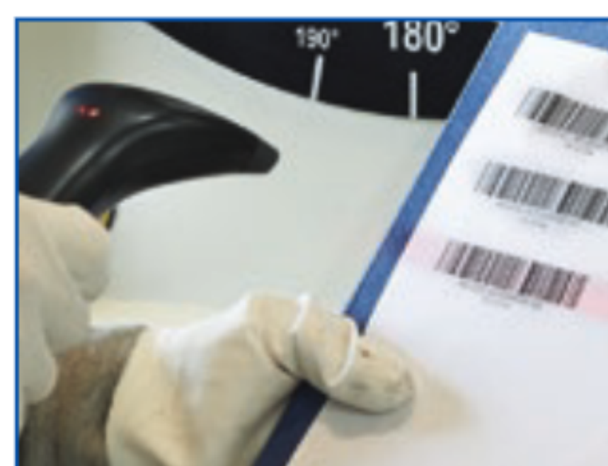
ES4 Upgrades (pgs. 36 & 37)