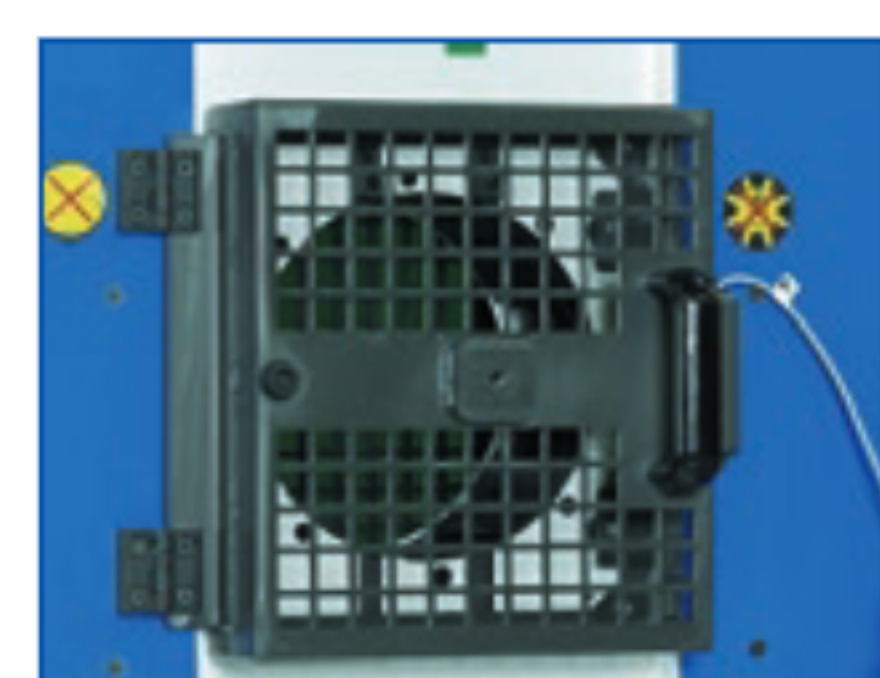
Protection Net with Activation Switch