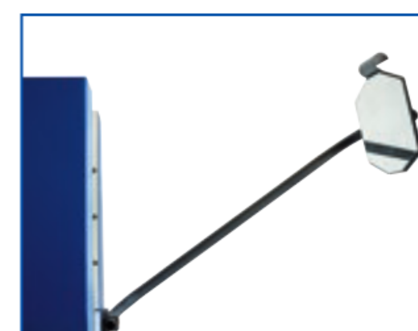
Back Mirror MIRROR-H135/170