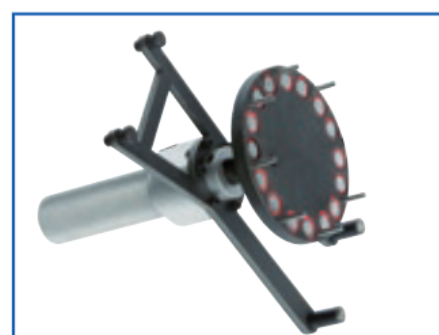
Patented Quick Change Die Tool KCPQCT-V59