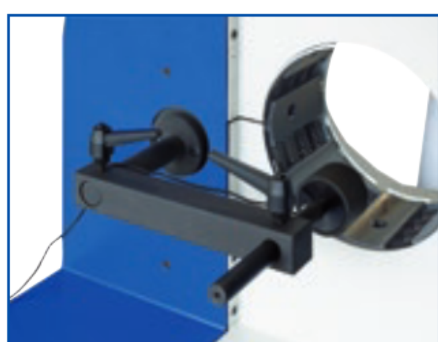
Back Limit Switch