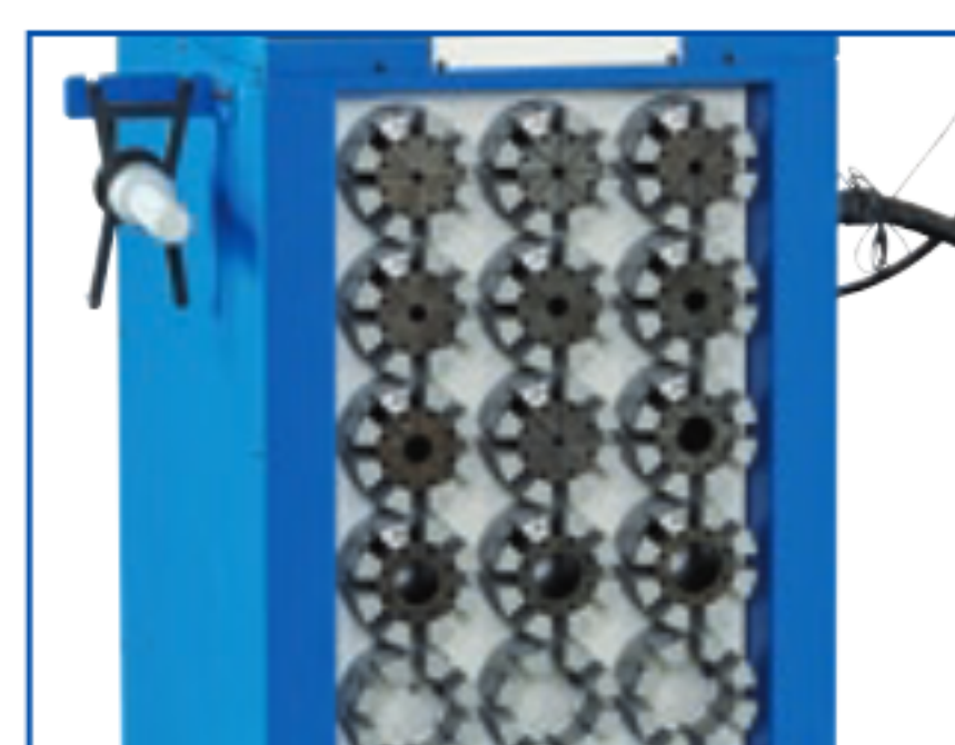
Die Holder Base (15 pc.)