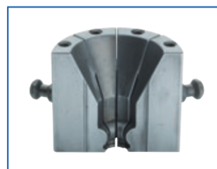
Custom Made Dies