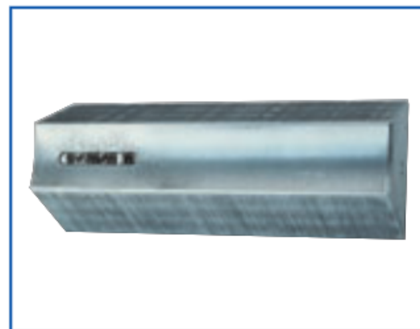
Marking Dies (pgs. 21 & 22)