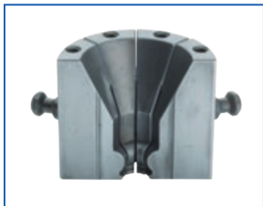
Custom Made Dies