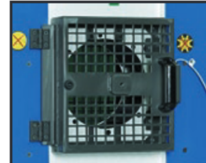
Protection Net with Activation Switch