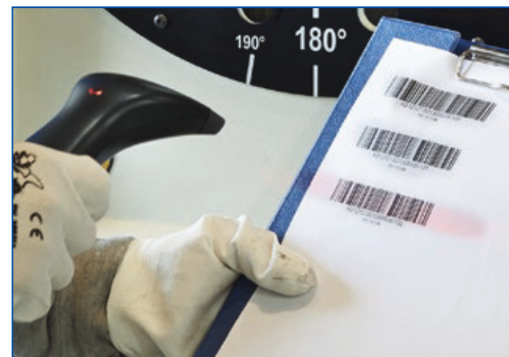
Barcode Reader instantly calls up saved crimp diameter