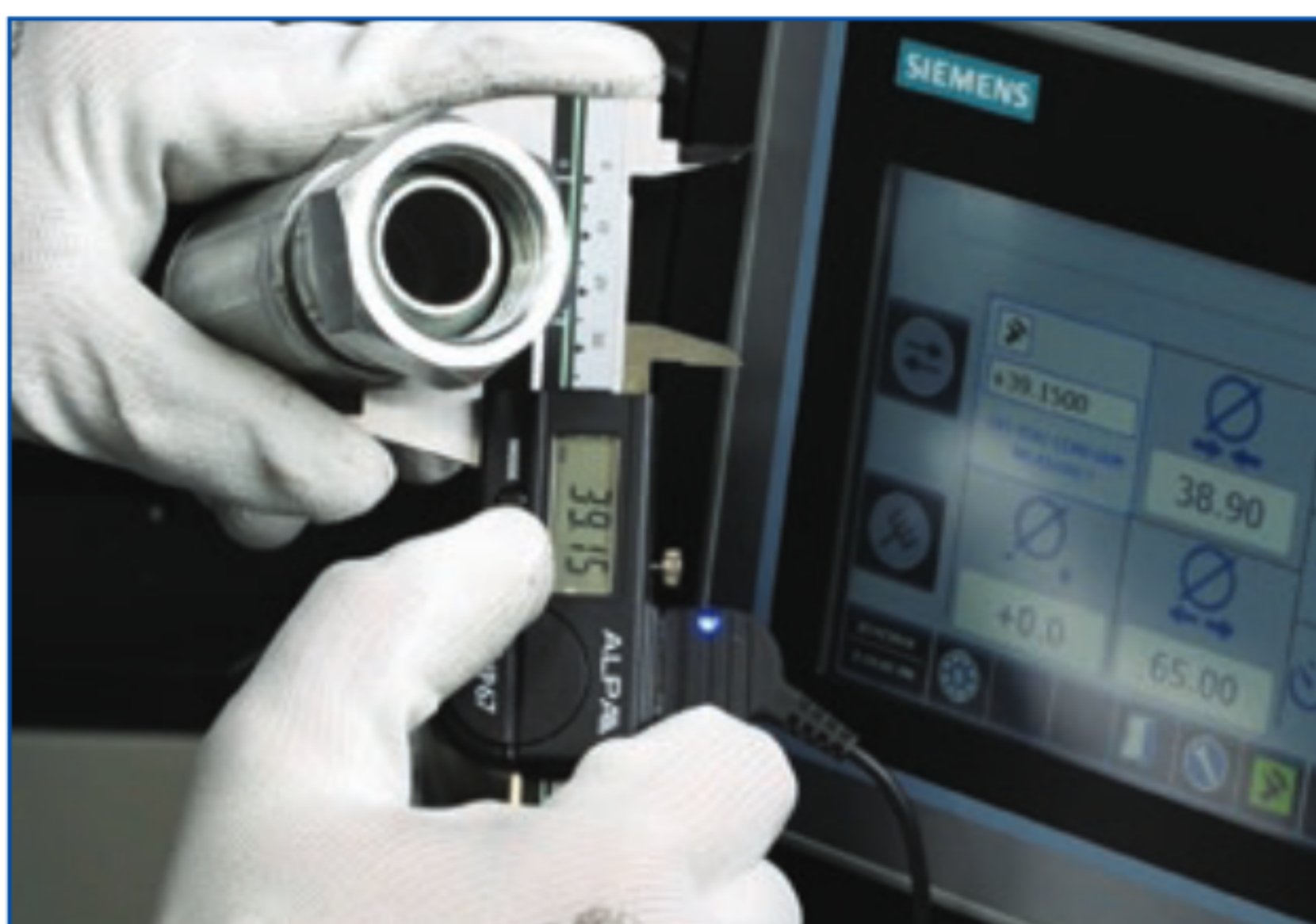
Digital Caliper automatically generates crimp correction for safety.

Webcam – Camera allows operator to view crimping process through 8" monitor. Includes additional LED lighting for better visibility.