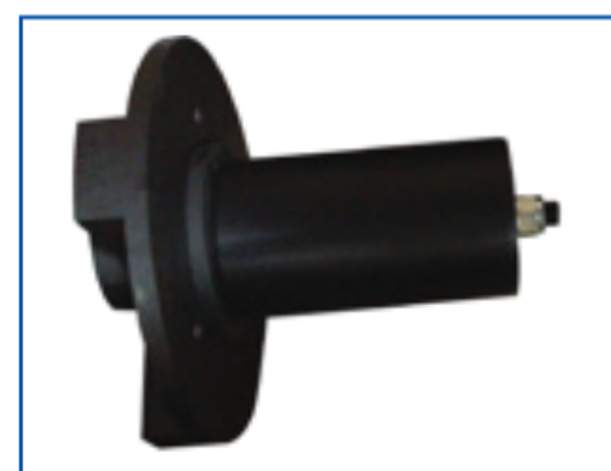
Concrete Hose Mandrels