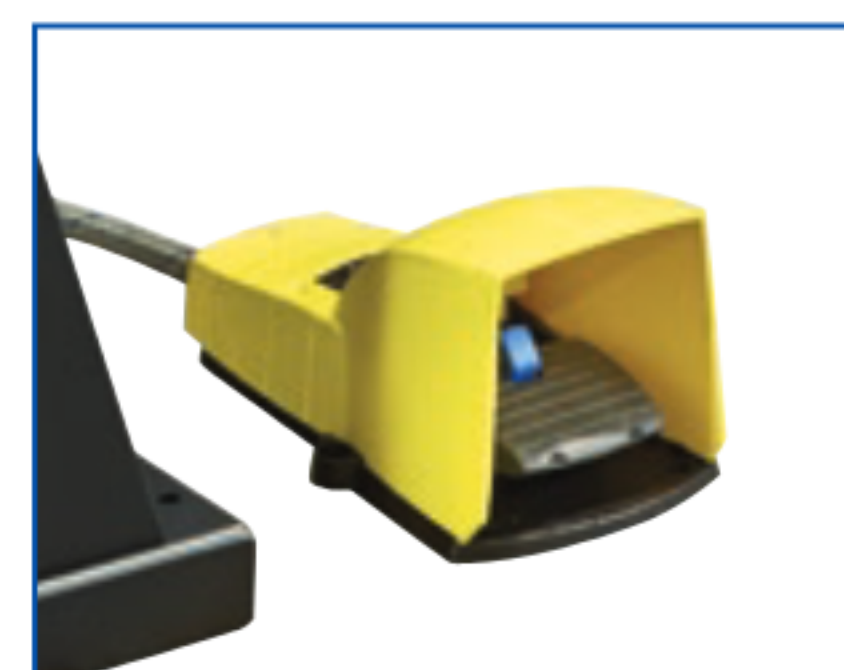
Electric Foot Pedal