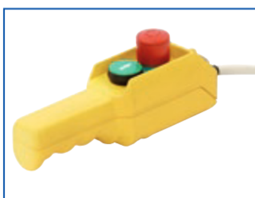
Handheld Electronic Control