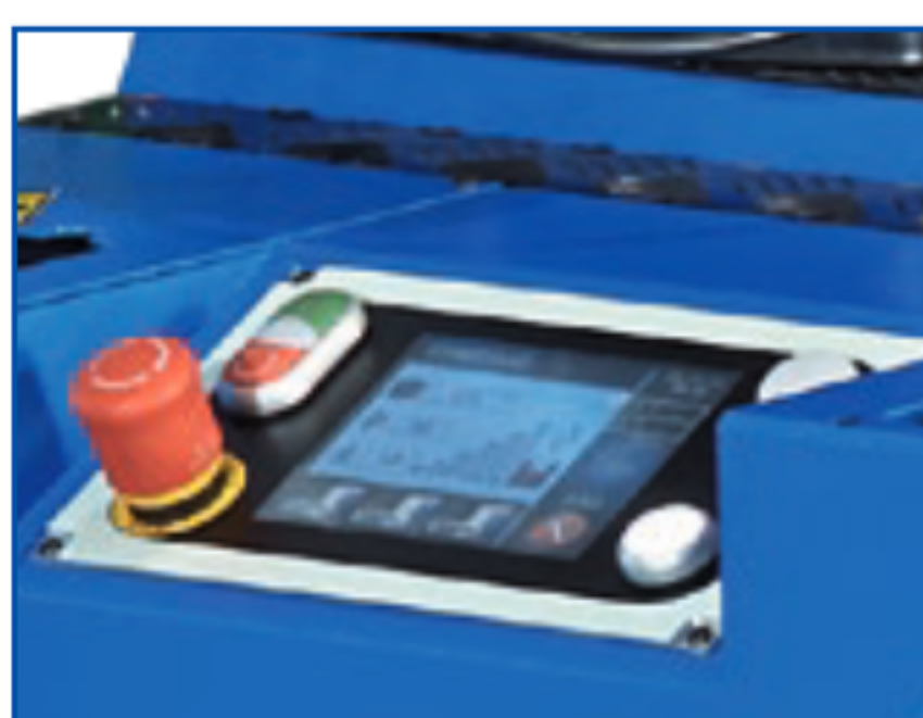
Touch Screen Electronic Control