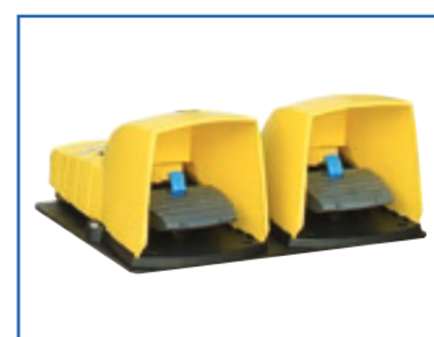
Electric Foot Pedals (Bending) PEDAL-MULT