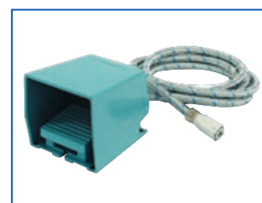
Electronic Foot Pedals (Flaring) PEDAL-ES