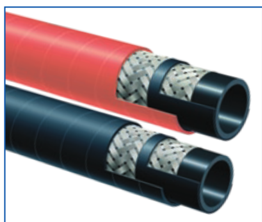
T341 Series Chlorobutyl Steam Hose