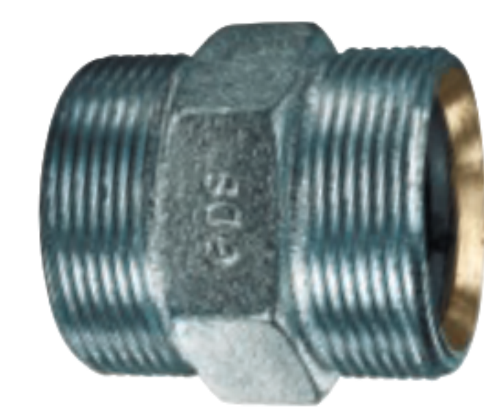
Double Spud with Copper Seal (Male NPS x Male NPS)