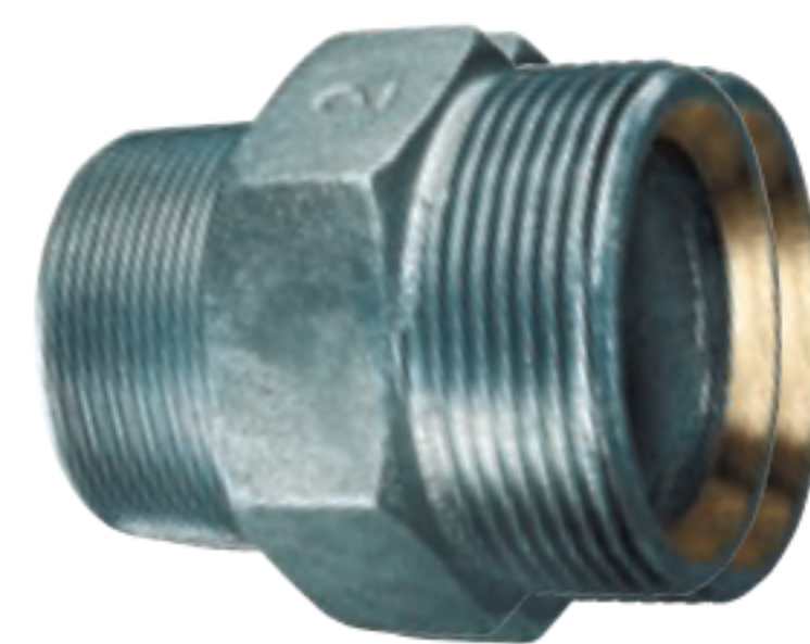
Male Spud with Copper Seal (Male NPT x Male NPS)