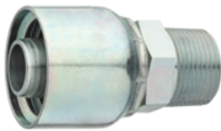
One-piece, Male Crimp NPT Fitting