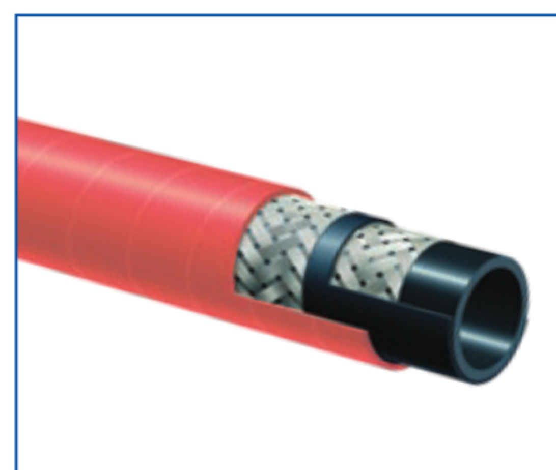
T343 Series EPDM Steam Hose with Oil Resistant Cover

Refer to pages 26 and 27 of the Alfagomma Catalog for details.