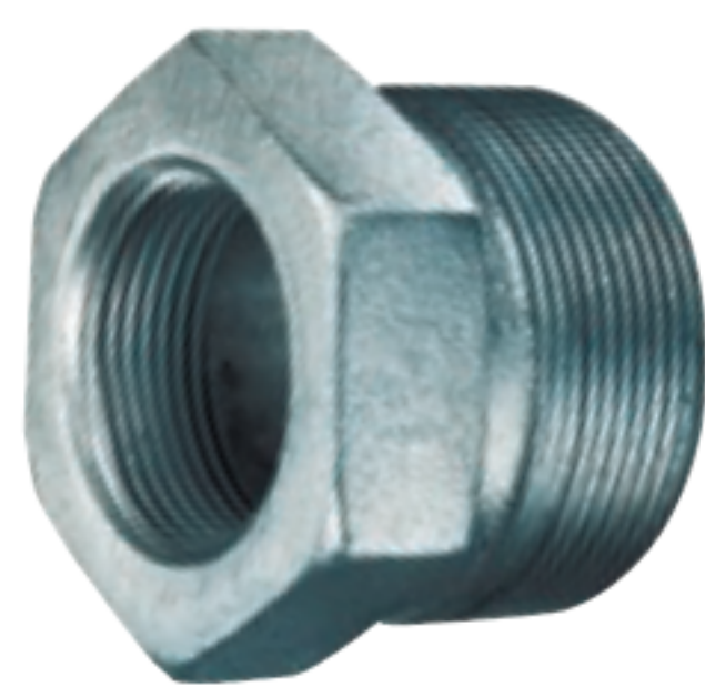
Female Spud with Copper Seal (Female NPT x Male NPS)