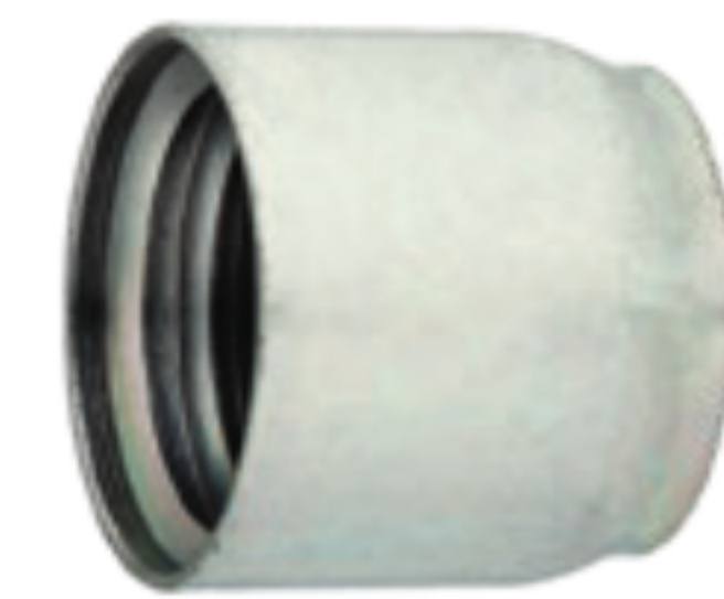
Crimp Ferrule for use with Female Ground Joint (SHGJ Series)