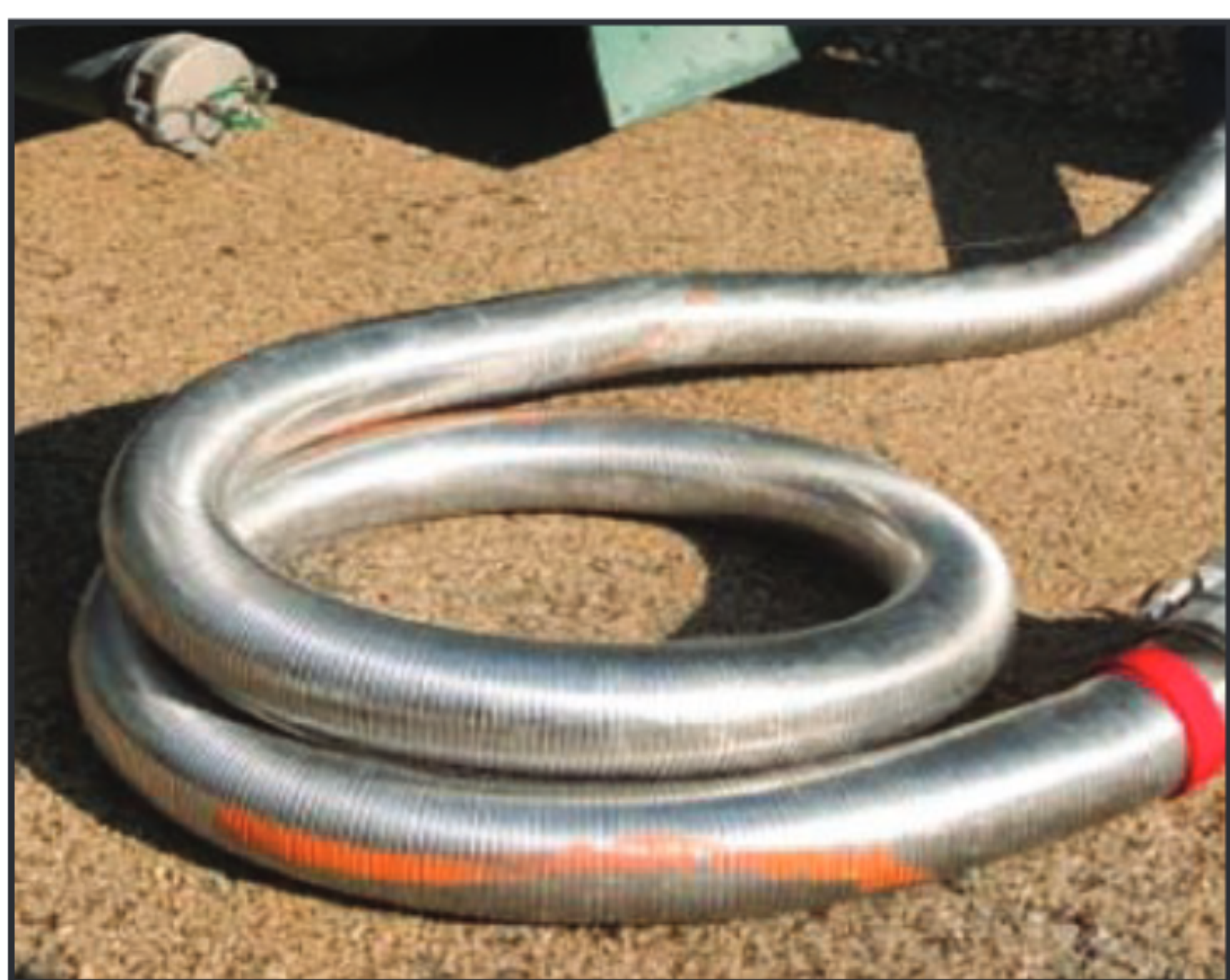
Create your own Tec Flex Assemblies