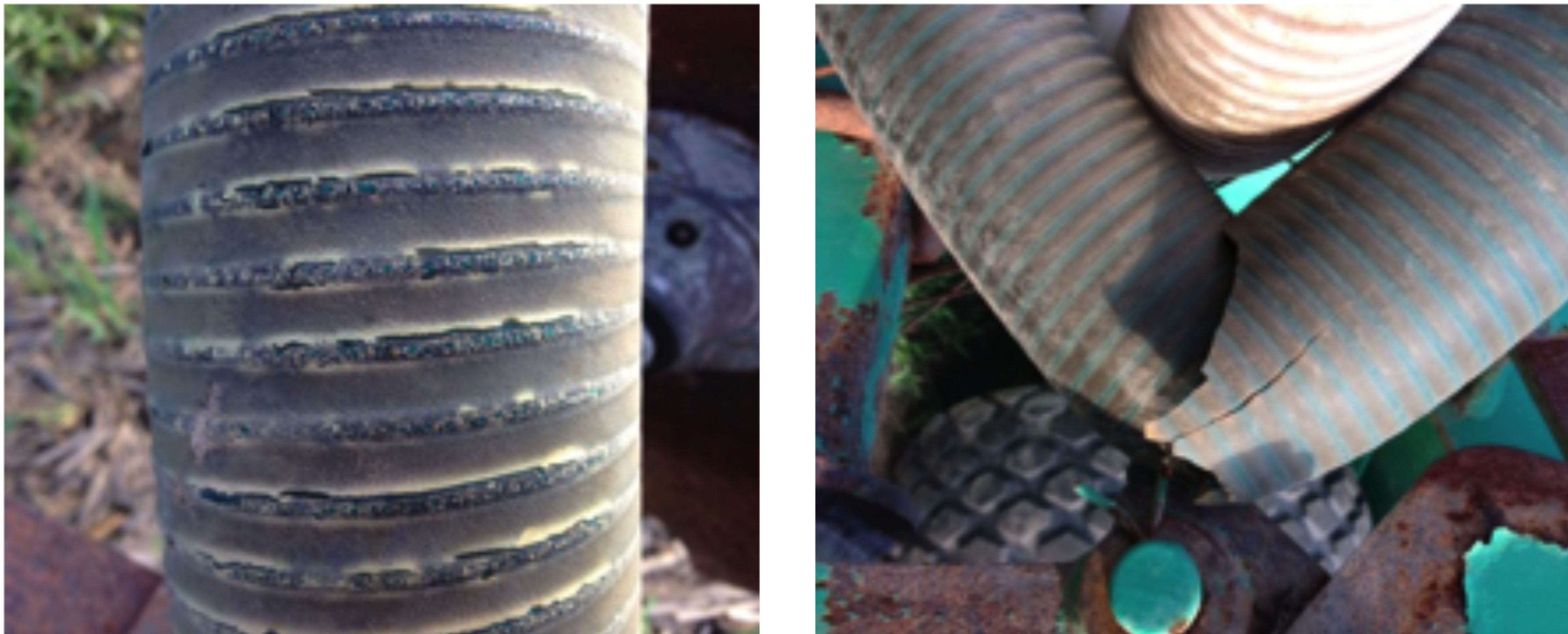
PVC Hose cracking due to UV exposure

Hoses used outdoors for prolonged periods of time are subject to damage resulting from exposure to both heat and UV light. Tigerflex™ Solarguard™ hoses are specially constructed to resist this type of damage, resulting in a hose that retains its strength and flexibility longer than standard PVC hoses.